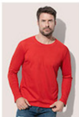
ST2500 Classic-T Long Sleeve